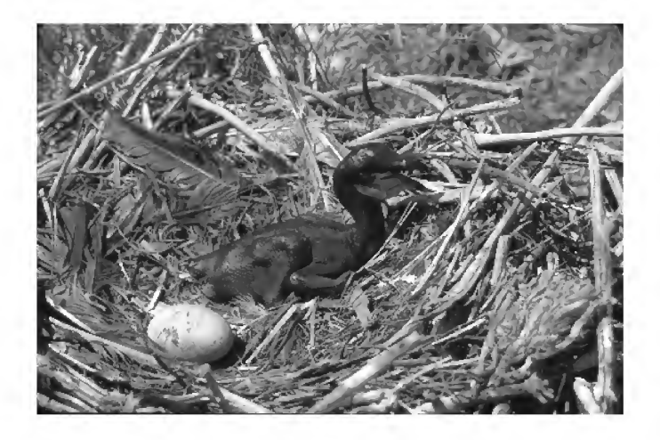
Double-crested Cormorant nest at Spring Island, Dorchester County, June 19, 1999.

Herons and Ibis . An American Bittern was seen on July 21 at Hollywood, not near any known breeding site (Rambo). Blom counted 61 Great Blue Herons at Havre de Grace on June 12. Two Great Blue Herons flying slowly, low over Cherry Creek in Pleasant Valley, Garrett County on June 13 before landing (Pope) may have been local breeders. The Great Blue Herons nesting in the colony at Vantage Point in Columbia had 10 active nests. Zeichner counted 17 young in the nests on June 27, Chestem noted 22-25 on July 19, and 3 full-grown young were still in one nest on August 3-4. An early dispersing Great Egret was at Liberty Lake on June 28 (Ringler) and a count of 26 at Wooton's Landing, Anne Arundel County on July 28 (Bystrak) was the high for the season. Jett found a Great Egret and 2 adult Little Blue Herons at Mattawoman Natural Environment Area, Charles County on July 5. The 11 Little Blue Herons at Elkton on June 4 (Watson-Whitmyre) were probably foraging from a colony